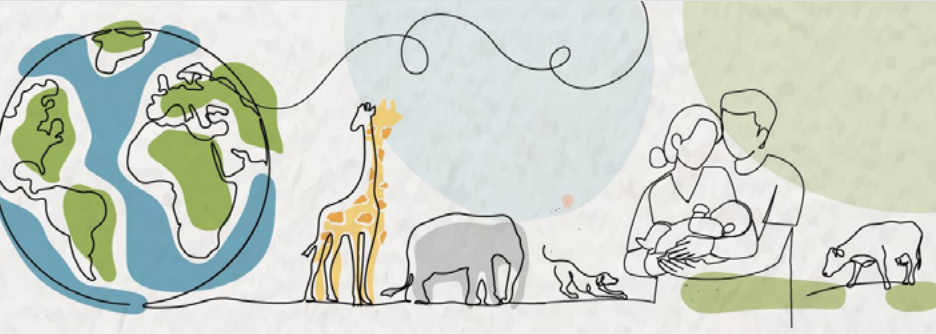
Click image to download