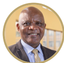
Dr John Nkengasong

Director, Africa Centres for Disease Control and Prevention