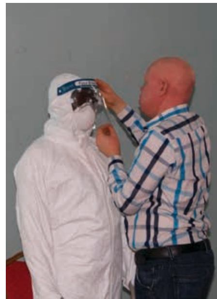
Demonstration of donning and doffing of personal protective equipment