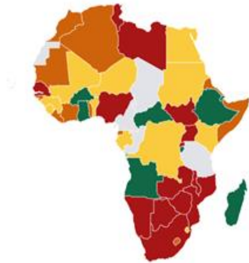
Figure 2. Map of AU Member States by hotspot level 16 on the PERC dashboard . This system is intended to highlight AU Member States needing attention due to an increasing or widespread outbreak. For specifics on calculations, refer to the dashboard methodology .

Table 3 below highlights changes in public health and social measures (PHSMs) for selected countries based on data from the Oxford COVID-19 Government Response Tracker . An up arrow indicates new PHSMs were announced; a horizontal arrow indicates PHSM was extended; a down arrow indicates PHSMs were loosened/expired. Member States are organized by tiers based on current epidemiological data from 25 June- 2 July 2021.