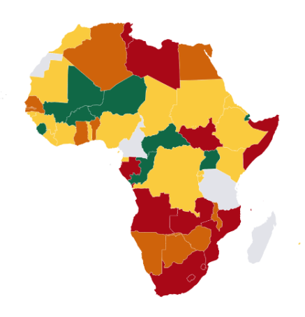
Figure 3. Map of AU Member States by hotspot level<sup>6</sup> on the PERC <u>dashboard</u>. This system is intended to highlight AU Member States in need of attention due to an increasing or widespread outbreak. For specifics on calculations, refer to the dashboard <u>methodology</u>.

The table below highlights changes in PHSMs by PERC hotspot warning level based on data from Oxford COVID-19 Government Response Tracker. An up arrow indicates new PHSMs announced. The horizontal arrow indicates PHSMs extended. The down arrow indicates PHSMs loosened/expired.