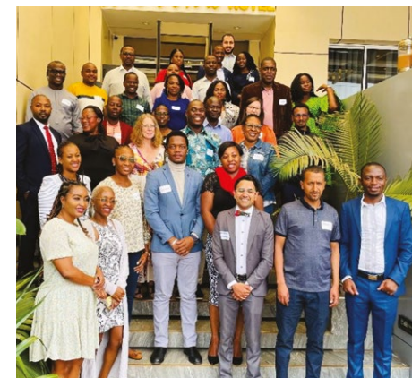
Induction training for 35 AVoHC Volunteers in Yaoundé, Cameroon; August 2023.

AVoHC has proved to be an important component of the continent's capacity to respond to outbreaks and other health emergencies using regional personnel to rapidly respond to events across countries as needs arise. To date deployments have included experts in epidemiology, laboratory sciences, communications, logistics, data management, social science, and clinicians. Africa CDC identified an important gap in deployment capacity, namely of mental health experts. We built capacity of rapid responders under AVoHC on MHPSS skills to enable them to address their psychological well-being and the psychological needs of affected communities.