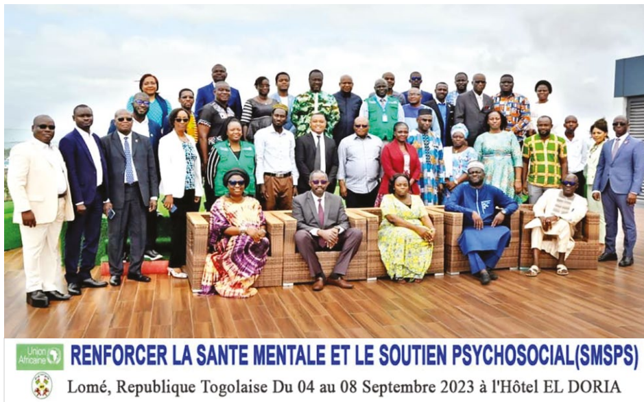
Regional workshop for Western and Central Africa to strengthen MHPSS integration into emergency preparedness and response, Lomé, Togo; September 2023