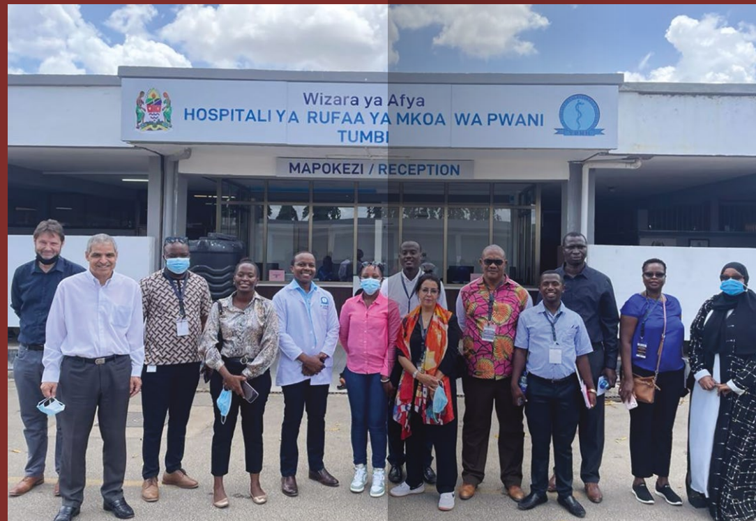
Field visit to the Muhimbili tertiary hospital in Dar-Es-Salaam, Tanzania; September 2022

In 2024, Africa CDC will launch a mental health leadership program to build capacity of 750 mental health leaders, strengthen public mental health systems in Member States and empower communities to influence public mental health in Africa.