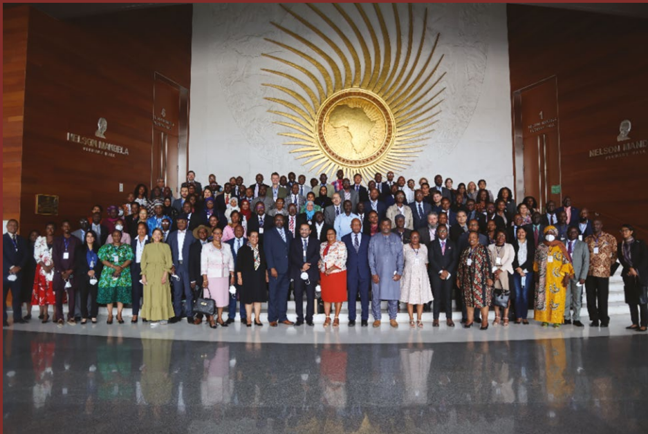
42 Member States and 6 Ministers of Health present in Addis Ababa to validate and launch the strategy, April 2022

In the second strategic plan (2023-2027), one of the priorities of Africa CDC is to strengthen integrated health systems to prevent and control high-burden diseases in Member States.