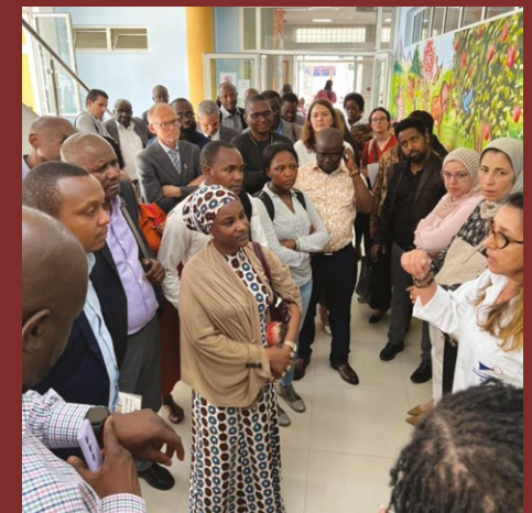
Field visit to the National Cancer Institute in Rabat, Kingdom of Morocco; May 2023