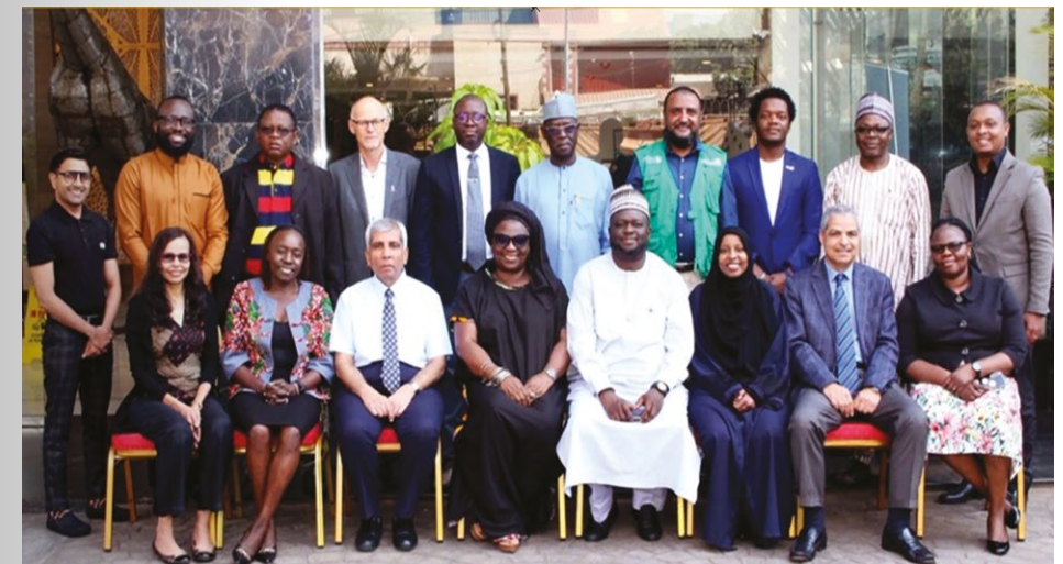
Annual planning meeting of the Advisory Committee; Kenya, Nairobi in March 2023

Link for the press release on the Launch of the Taskforce: https://au.int/en/pressreleases/20231104/first-ever-african-union-taskforce-non-communicable-diseases-injuries-and