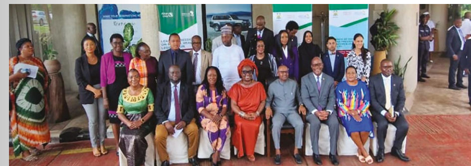
Launch of the Presidential Taskforce on Mental Health in Sierra Leone, May 2023.

Mental health is an integral part of our general health and well-being and a basic human right. Mental health legislation is a crucial component of good governance and concerns specific legal provisions relating to mental health. Africa CDC is conducting regional advocacy for mental health policies and legislations to be implemented in line with continental and global standards, support Member States to review their mental health policies and legislation through country-to-country peer learning.