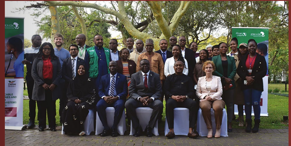
Country assessment and peer learning workshop on NCDIMH surveillance system strengthening, July 2023 Zambia / Lusaka