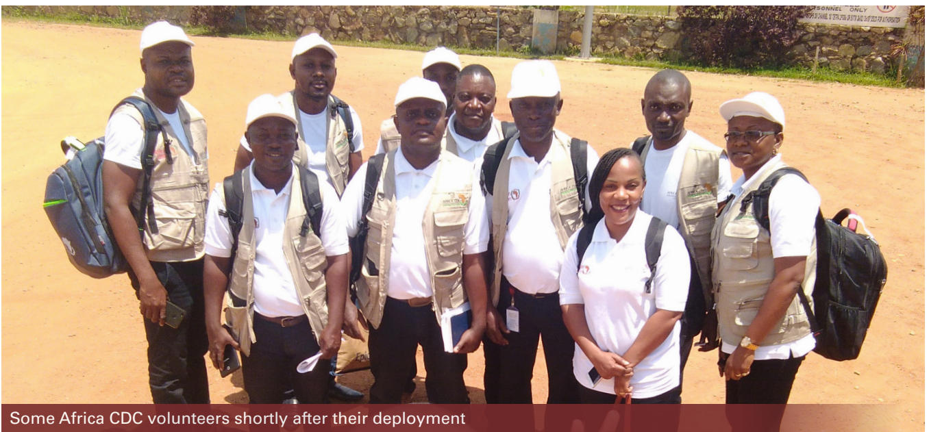
Some Africa CDC volunteers shortly after their deployment

For more than one year, the Government of DRC and partners have been working together to curtail the 10th EVD outbreak in the country, which has affected mainly Ituri and North Kivu Provinces, and recently spread to South Kivu.