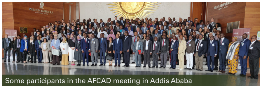
Some participants in the AFCAD meeting in Addis Ababa