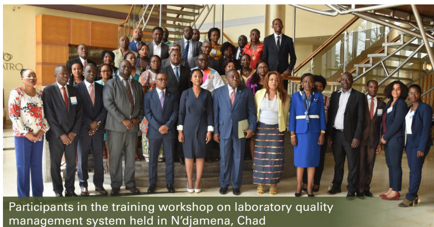
Participants in the training workshop on laboratory quality management system held in N'djamena, Chad

RISLNET is an initiative of Africa CDC to promote networking, partnerships and collaboration for the advancement of a unified agenda for disease control and prevention at the regional level in Africa. The African Union cooperative agreement for RISLNET is currently being implemented in Central Africa by the Global Health Systems Solutions under close supervision by Africa CDC. ability to respond promptly to future outbreaks.