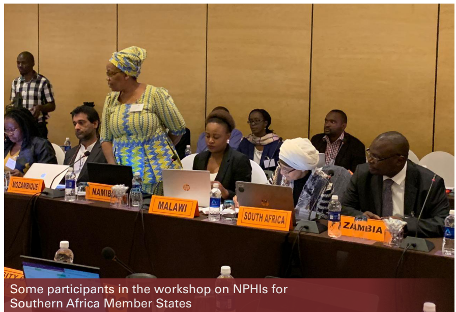
Some participants in the workshop on NPHIs for Southern Africa Member States

To address these problems, the Southern Africa Regional Collaborating Centre hosted a workshop for the 10 Member States in the Southern Africa region from 11 to 13 September 2019. Organized