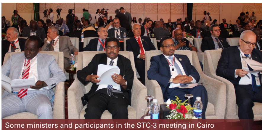
Some ministers and participants in the STC-3 meeting in Cairo

Health Ministers of African Union Member States adopted a Common African Position (CAP) on Antimicrobial Resistance (AMR) during the Third Specialized Technical Committee (STC-3) on health meeting held in Cairo, Egypt, from 29 July to 2 August 2019. This followed the review and endorsement of the document by AMR experts and stakeholders.