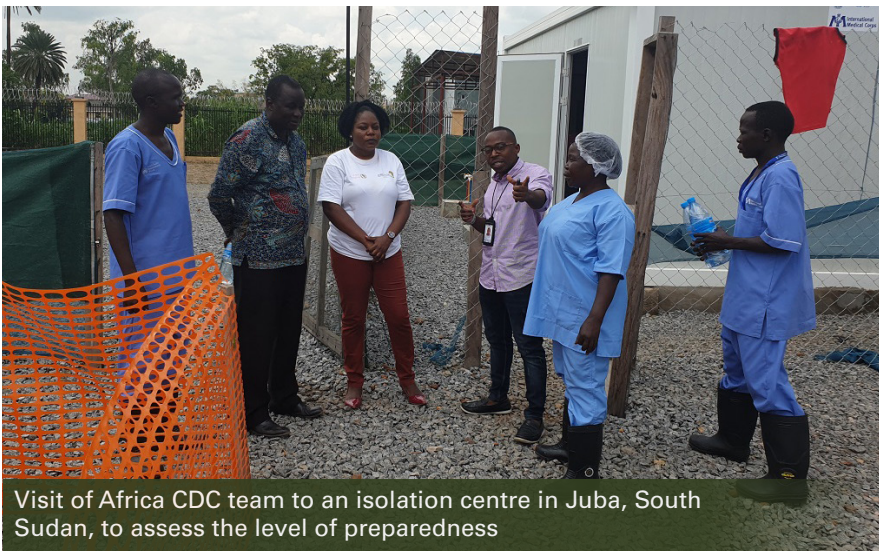
Visit of Africa CDC team to an isolation centre in Juba, South Sudan, to assess the level of preparedness

The current EVD outbreak in the DRC has lasted more than one year. However, the outbreak has been contained within three provinces – Ituri, North Kivu and South Kivu. Among the nine countries that share borders with the DRC, Burundi, Rwanda, South Sudan, and Uganda are closest to the three affected provinces. There has been a confirmed case in Uganda and another one at its border crossing with the DRC. As of 30 September 2019, there have been no reported cases in Burundi, Rwanda, and South Sudan, but there have been cases in Goma, a city that is about 2 km from Rwanda, and a case in Ariwara, north east Ituri, bordering the Yei River State in South Sudan.