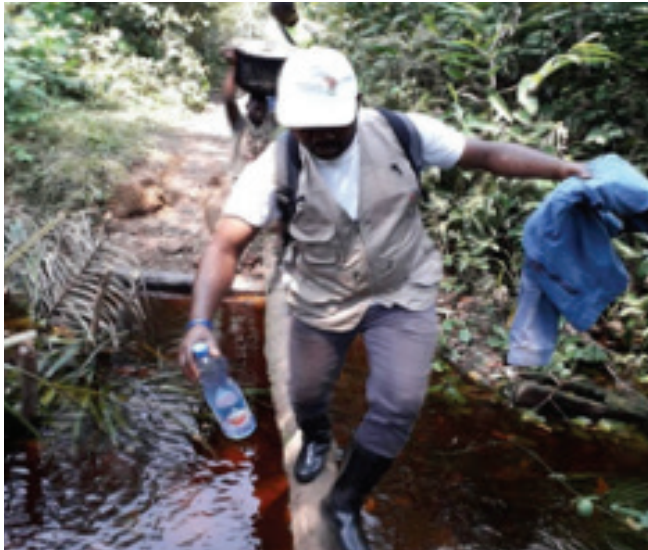
Africa CDC epidemiologist crossing the river Lolo in search of an individual who had been in contact with an Ebola infected person in Weli, Bosolo