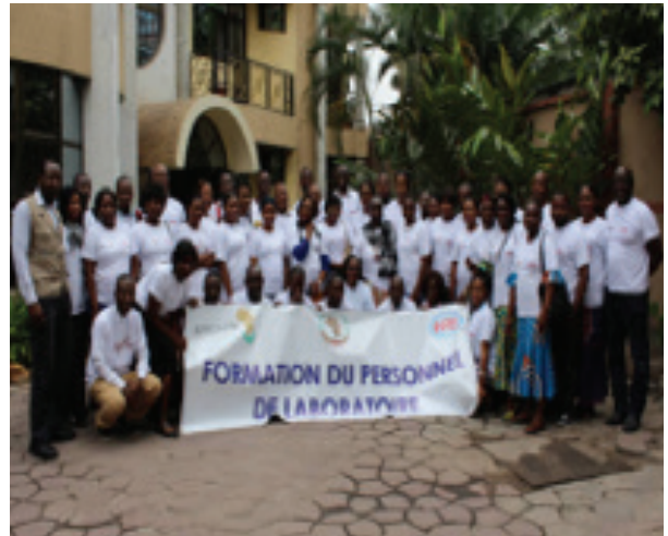
Laboratory technicians and scientists from the Ministry of Health and INRB participating in a three days EVD Laboratory diagnosis training.

Based on the identified gaps and need of the Ministry of Health, Africa CDC supported training of a total of 320 experts on Ebola laboratory diagnosis (50), surveillance and disease intelligence (50), and border screening and monitoring (220).