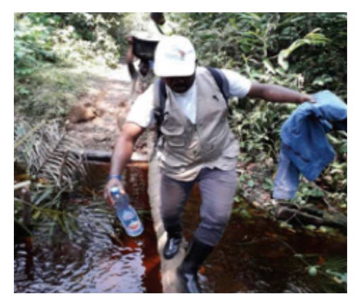
Africa CDC epidemiologist crossing the river Lolo in search of an individual who had been in contact with an Ebola infected person in Weli, Bosolo