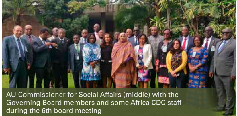
AU Commissioner for Social Affairs (middle) with the Governing Board members and some Africa CDC staff during the 6th board meeting

Hon. Malachie Manaouda, Minister of Health Cameroon; Hon. Sicily Kariuki, Minister of Health Kenya; Hon. Akram Ali Eltom, Minister of Health Sudan; Hon. Abdoulaye Diouf Sarr, Minister of Health Senegal; Hon. Khalid Ait Taled, Minister of Health Morocco; Hon. Hala Zaid, Minister of Health Egypt; Dr Githinji Gitahi, Group CEO, AMREF Health Africa; Dr Stanley Okolo, Director General WAHO and Janine Benedicte Diagou, CEO, NSIA Insurance