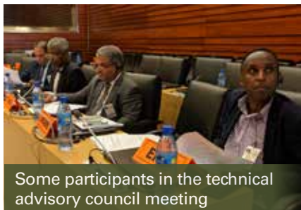
Some participants in the technical advisory council meeting