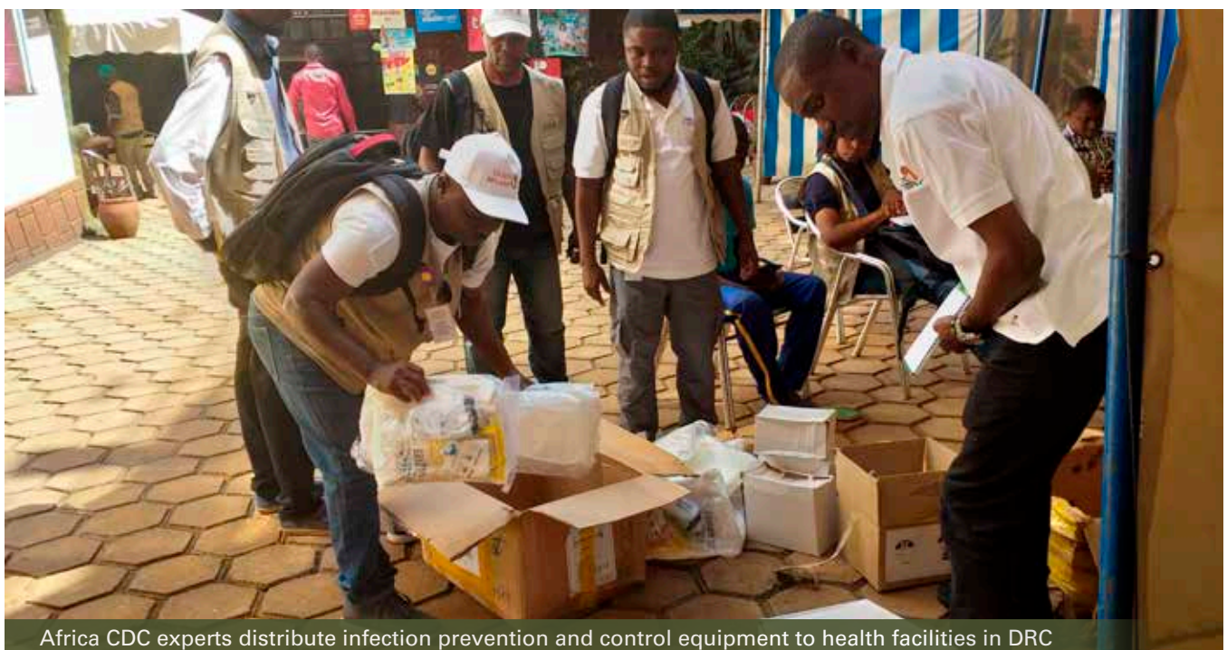
Africa CDC experts distribute infection prevention and control equipment to health facilities in DRC

This new trend is encouraging and gives the confidence that if the current tempo is sustained, with additional support from different sources, the outbreak will be contained and end within a short time.