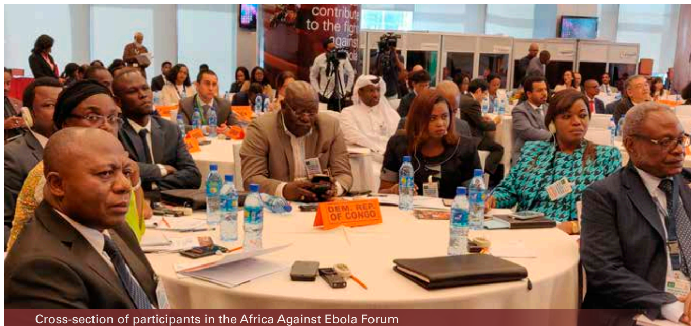
Cross-section of participants in the Africa Against Ebola Forum

The year 2019 began with a continuation of the Ebola Virus Disease outbreak in the Democratic Republic of Congo (DRC). As the year progressed, the number of cases continued to increase. Each week more and more people became infected, some of whom have died.