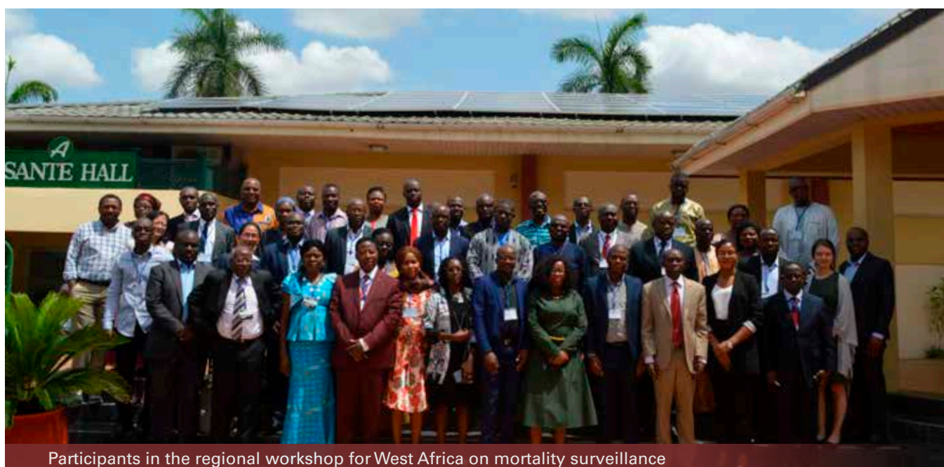
Participants in the regional workshop for West Africa on mortality surveillance

As Africa's population and development expand, Member States are facing a challenge of how to invest in improving the health of their citizens. A critical priority is having high quality data about who dies and why, but many Member States have no systems to accurately collect this information. Better data about mortality could mean better policies to prevent deaths and increase life expectancy.