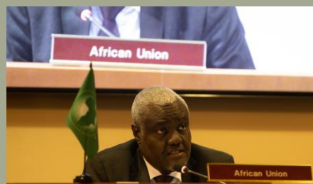
H.E. Mr. Moussa Faki Mahamat, Chairperson, African Union Commission