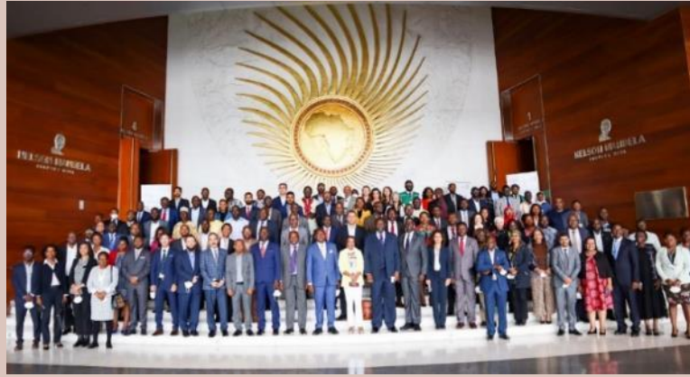
Delegates pose for a group photo at the Continental EPI Managers' Workshop for the Acceleration of COVID-19

Continental workshop for managers in the Expanded Programme on Immunization (EPI). The Africa CDC, in collaboration with UNICEF, the WHO, and other stakeholders hosted a workshop to track progress towards the 70% vaccination target by the end of 2022, while reaching most vulnerable groups and strengthening countries' health systems and routine immunization. Over 200 delegates from African Union member states and partners attended the workshop held on September 5 in Addis Ababa, Ethiopia, including an official delegation of 46 member states. Read more