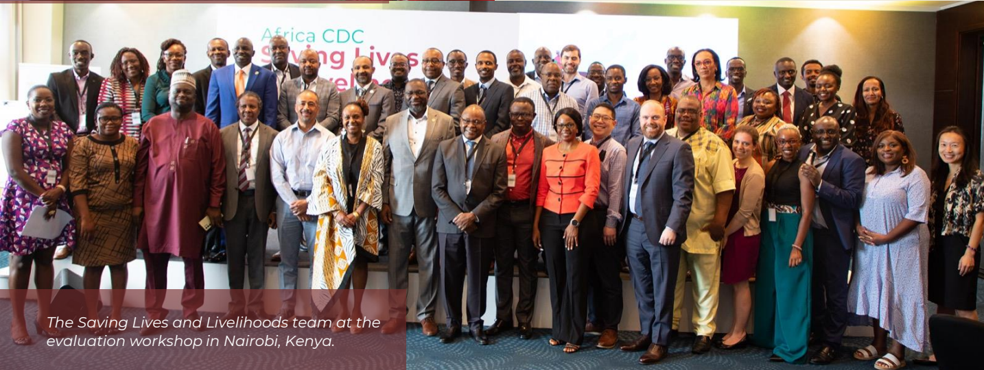
The Saving Lives and Livelihoods team at the evaluation workshop in Nairobi, Kenya.