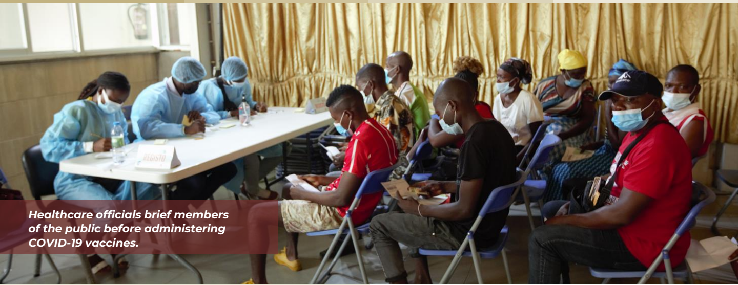
Healthcare officials brief members of the public before administering COVID-19 vaccines.