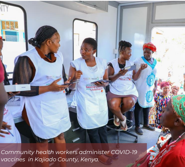
Community health workers administer COVID-19 vaccines in Kajiado County, Kenya.