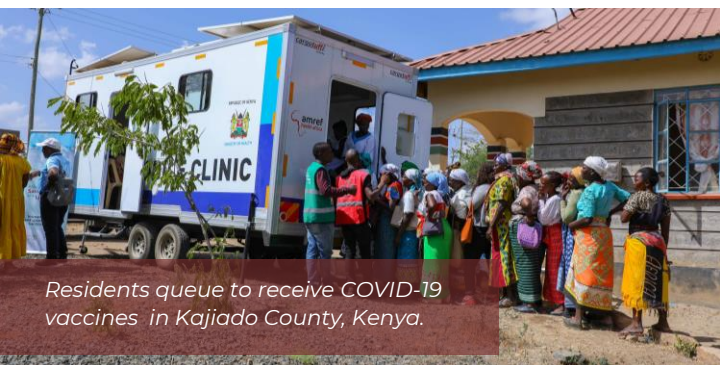
Residents queue to receive COVID-19 vaccines in Kajiado County, Kenya.