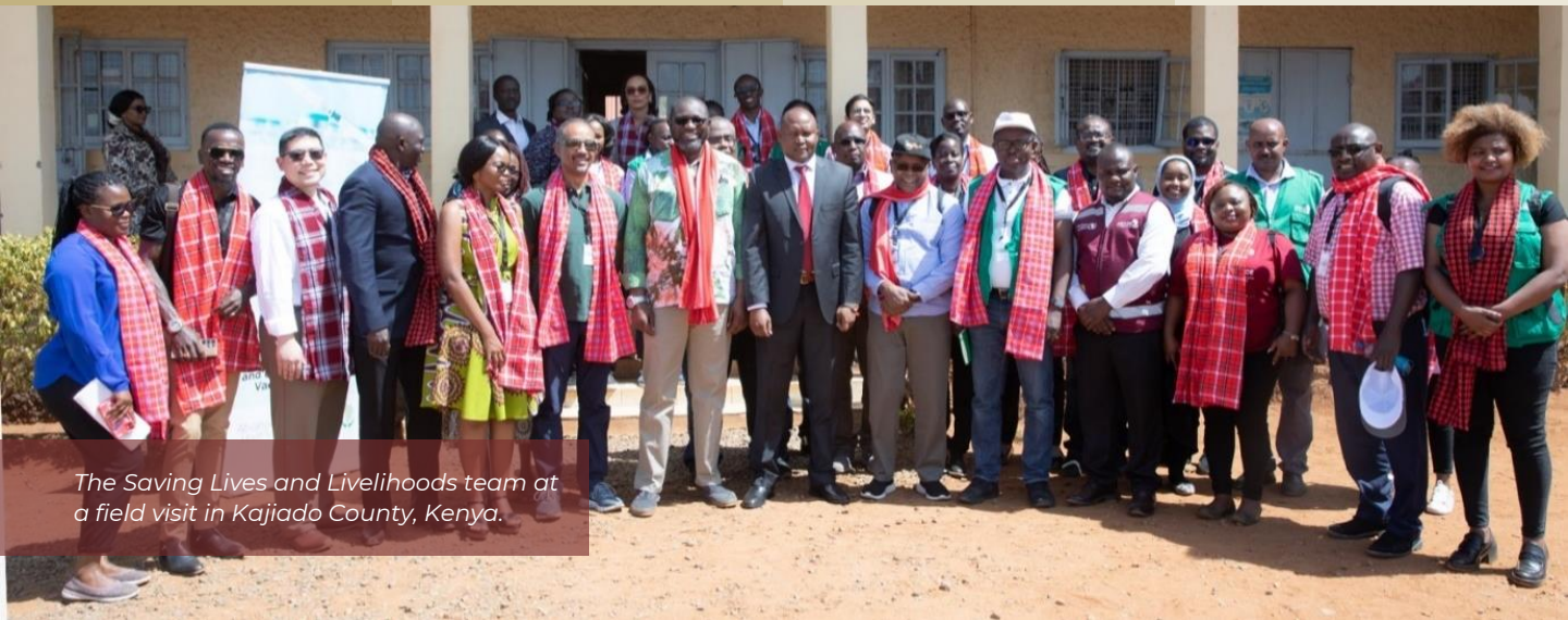
The Saving Lives and Livelihoods team at a field visit in Kajiado County, Kenya.