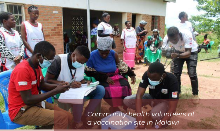
Community health volunteers at a vaccination site in Malawi