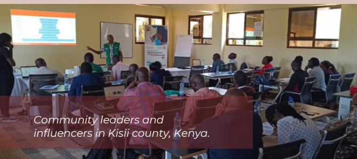
Community leaders and influencers in Kisii county, Kenya.

As a result, a total of 6,404 eligible persons were vaccinated, translating to an increase in vaccination coverage and community acceptance. This vaccination drive strengthened collaboration among stakeholders.