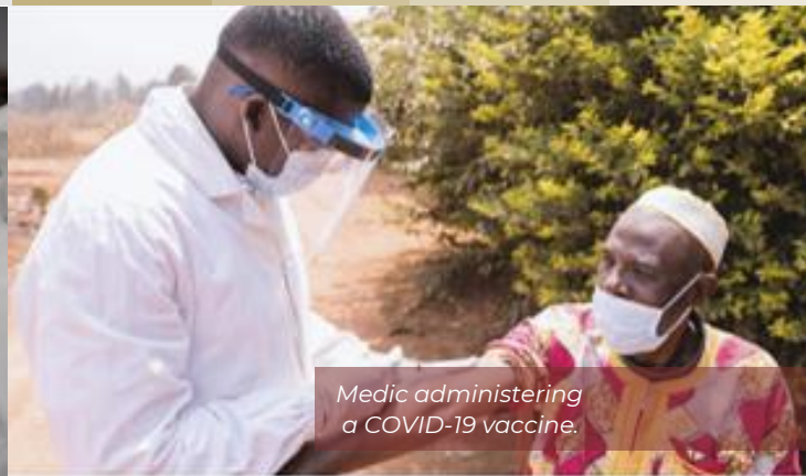
Medic administering a COVID-19 vaccine.