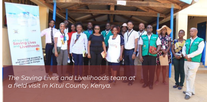
The Saving Lives and Livelihoods team at a field visit in Kitui County, Kenya.

The collaborative workshop brought together a diverse group of stakeholders to shape the program's direction and future implementation strategy. Stakeholders also resolved to communicate the impact of the program to raise awareness and accountability among stakeholders and the wider public.