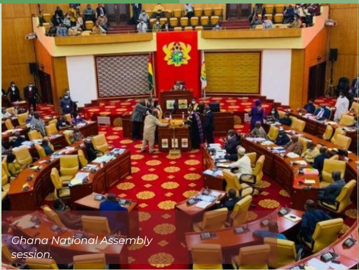
Ghana National Assembly session.