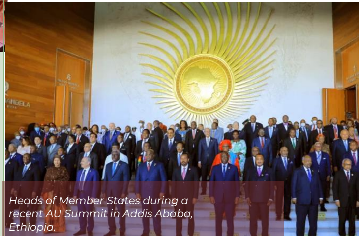
Heads of Member States during a recent AU Summit in Addis Ababa, Ethiopia.

The Africa CDC has welcomed the Pandemic Fund's recent Call for Proposals and encourages AU Member States to submit their expressions of interest (EOIs) before the February 24 deadline.