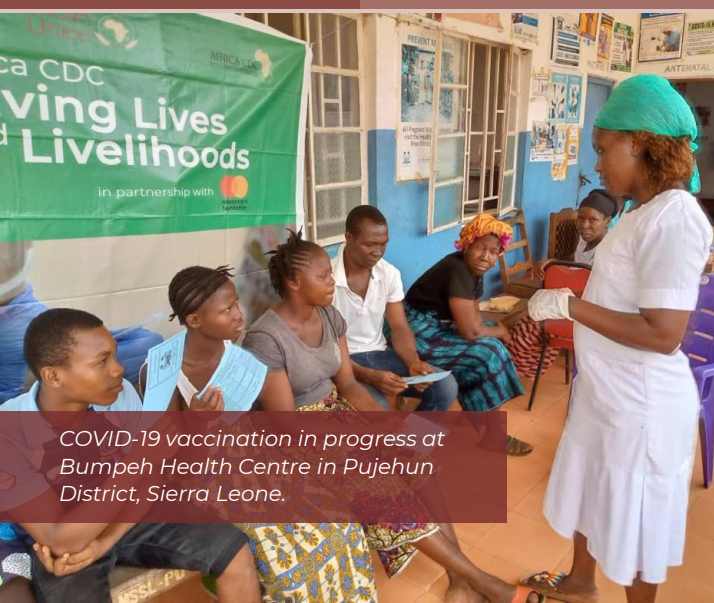
COVID-19 vaccination in progress at Bumpeh Health Centre in Pujehun District, Sierra Leone.