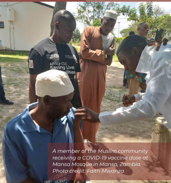
A member of the Muslim community receiving a COVID-19 vaccine dose at Mansa Mosque in Mansa, Zambia.