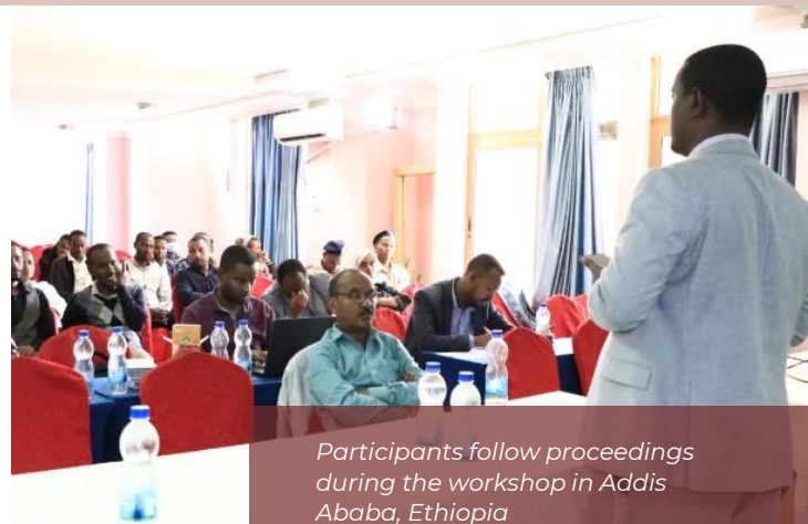
Participants follow proceedings during the workshop in Addis Ababa, Ethiopia

The Ethiopian Ministry of Health and the Ethiopian Red Cross Society partnered to address COVID-19 vaccine hesitancy among members of the Defence and Federal Police, who are at high risk of contracting the virus due to their living and working conditions. A capacity-building workshop was organized and attended by public relations experts from the forces.