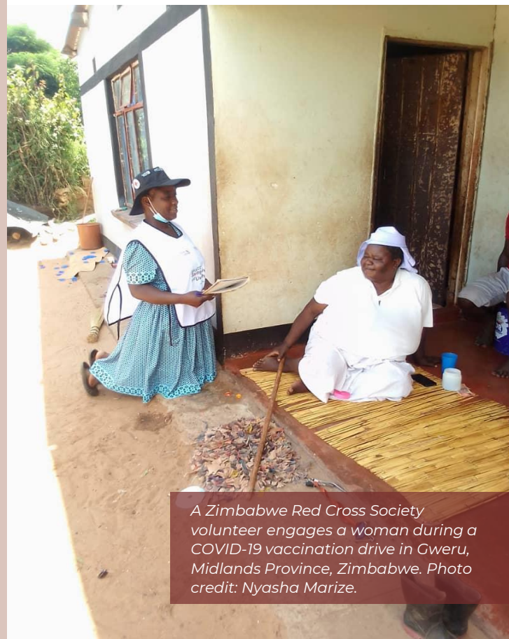
A Zimbabwe Red Cross Society volunteer engages a woman during a COVID-19 vaccination drive in Gweru, Midlands Province, Zimbabwe.

A nationwide COVID-19 vaccination campaign was conducted in Zimbabwe in March with support from the Zimbabwe Red Cross Society. Volunteers were mobilized to encourage communities to get vaccinated.