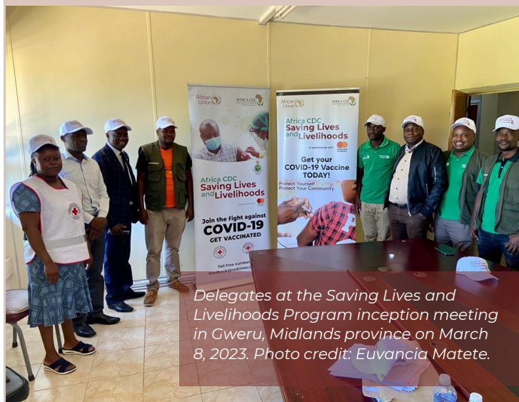
Delegates at the Saving Lives and Livelihoods Program inception meeting in Gweru, Midlands province on March 8, 2023.

Key approaches include understanding community beliefs, fears, rumours, questions, and suggestions about COVID-19 and vaccines to inform the response, as well as reducing fear, stigma, and misinformation about vaccines.