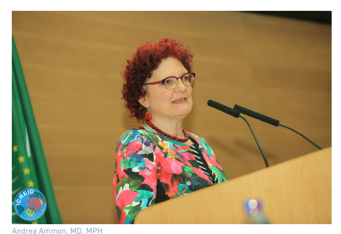
European Centre for Disease Prevention and Control, Sweden

The Africa CDC encourages all member states to have their own response teams. Nevertheless, the CDC also has rapid response teams which can be deployed when needed. Since resources and trained work force are often scarce, frameworks for other diseases should be integrated to have a more effective approach. The framework for HIV for instance, is solid and people can be trained for emerging infectious diseases and used when required. These people can be trained for an outbreak response and deployed when needed. In order to share all experience and research from the continent within the continent, the Africa CDC has established a journal, Journal of Public Health Africa.